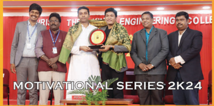
MOTIVATIONAL SERIES 2K24