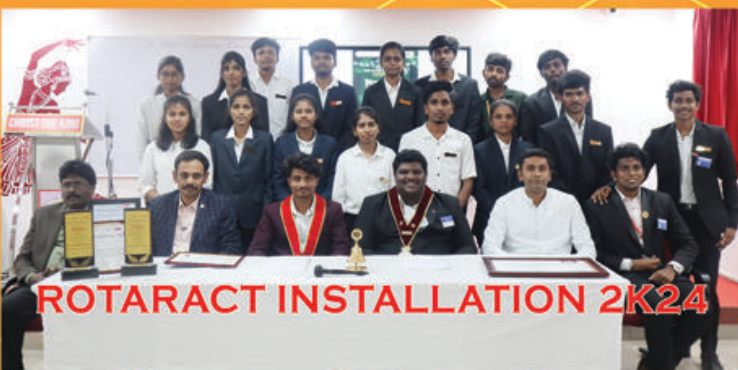
ROTARACT INSTALLATION 2K24