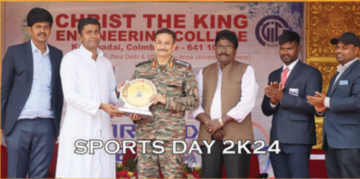
SPORTS DAY 2K24