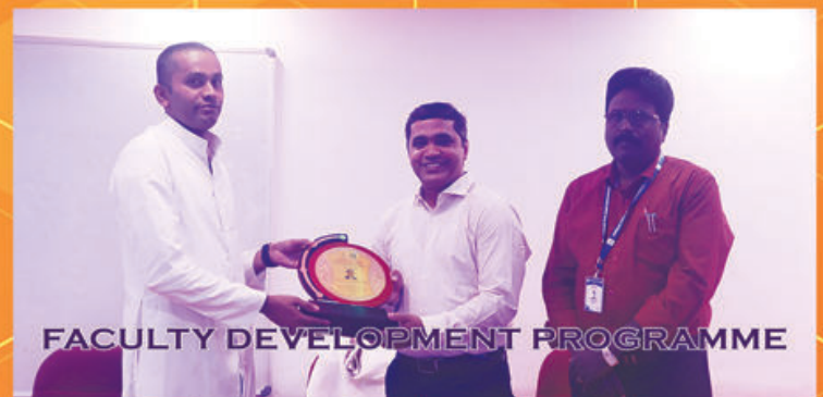
FACULTY DEVELOPMENT PROGRAMME