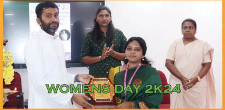
WOMENS DAY 2K24