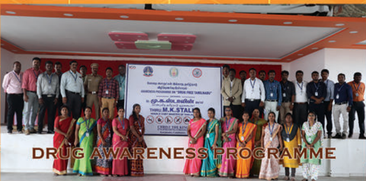
DRUG AWARENESS PROGRAMME