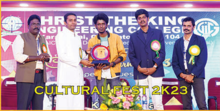
CULTURAL FEST 2K23