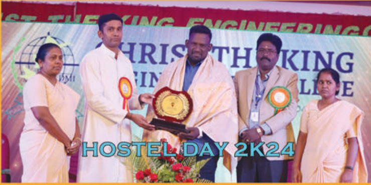
HOSTEL DAY 2K24