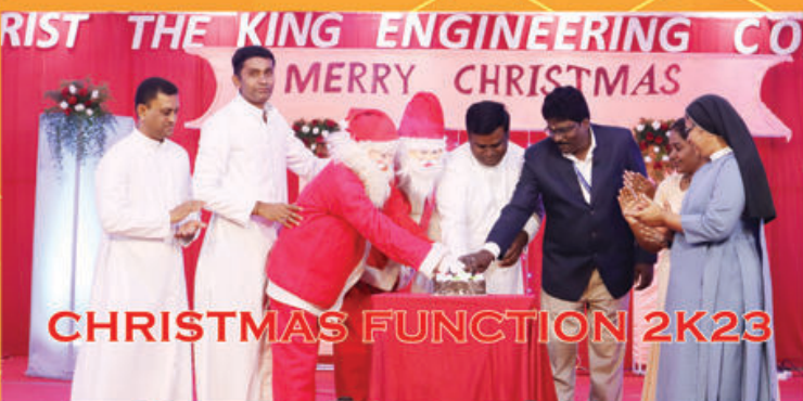
CHRISTMAS FUNCTION 2K23