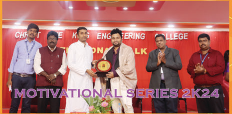
MOTIVATIONAL SERIES 2K24