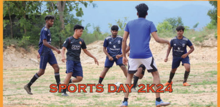
SPORTS DAY 2K24