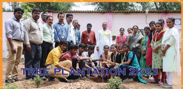
TREE PLANTATION 2K23