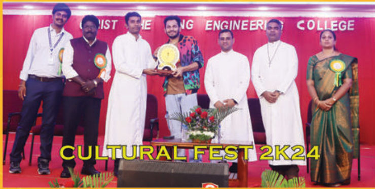
CULTURAL FEST 2K24