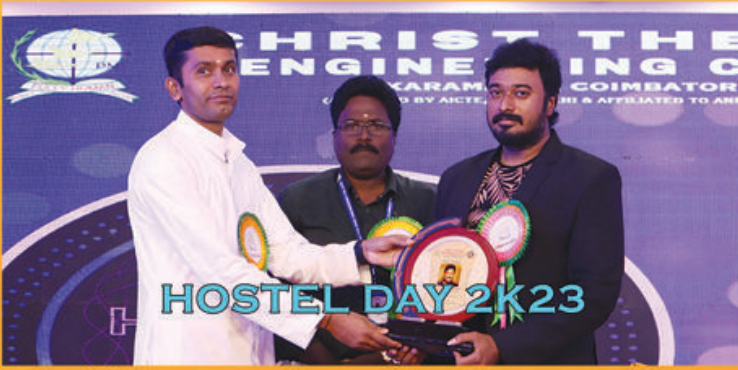
HOSTEL DAY 2K23