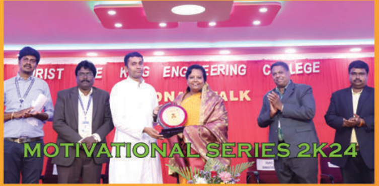
MOTIVATIONAL SERIES 2K24