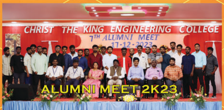
ALUMNI MEET 2K23