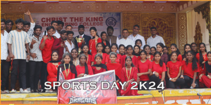
SPORTS DAY 2K24