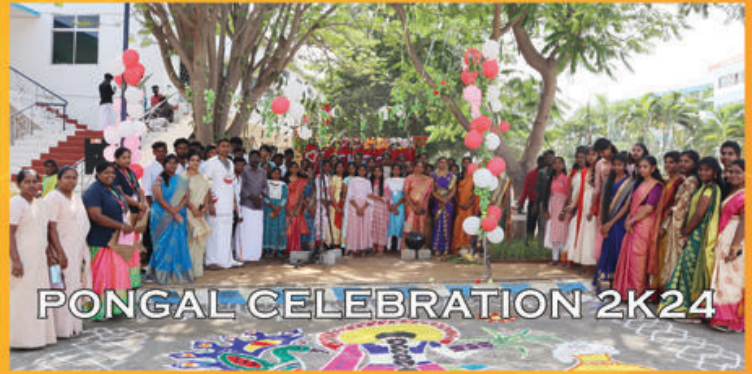
PONGAL CELEBRATION 2K24