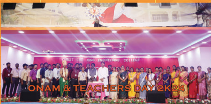
ONAM & TEACHERS DAY 2K24